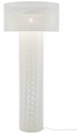
HANGING LAMP UL LISTED